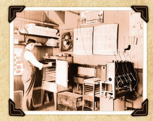
A Standard of Unparalleled Quality and Integrity