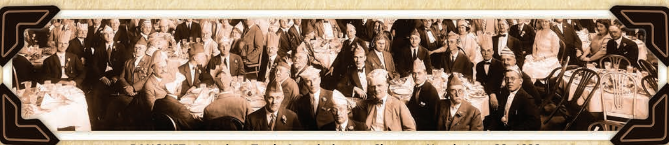
BANQUET - American Trade Association - at Sherman Hotel - June 22, 1922